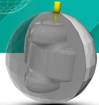
12 - 13 lbs.